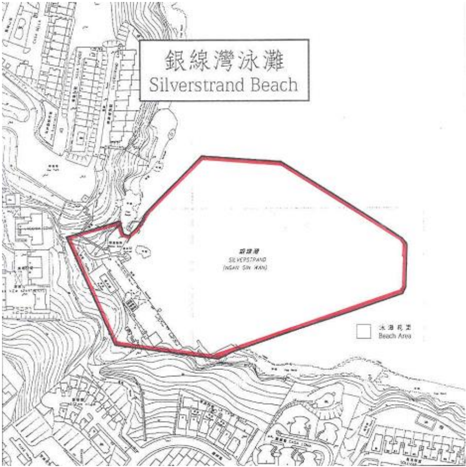
(Not to scale)